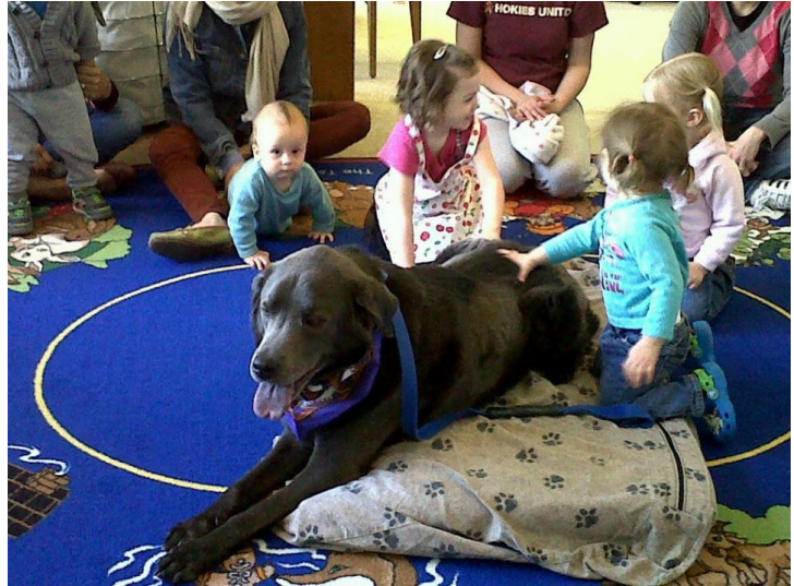
Blue - a great RDR volunteer!

Everyone really enjoyed the sessions and we will be back on July 10th and 11th.